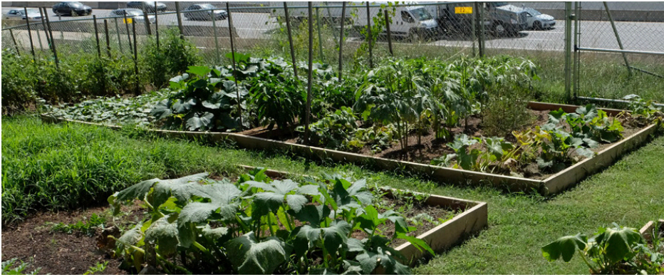
Trees and vegetation planted in Genesis Park, along I-77, will provide relief from the noise, reduce pollution, and enhance beauty.