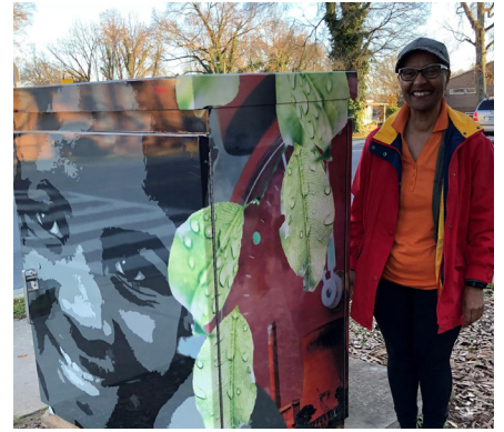
Artist Sala Faruq's artwork beautifies a traffic signal box.